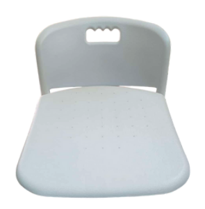
The Way Of Exellence